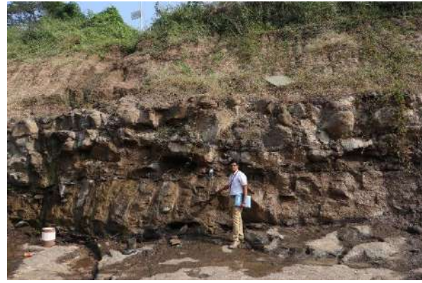
Fig. 4 - Collection of engineering geological data of nearly horizontal flow sequence of basaltic rocks