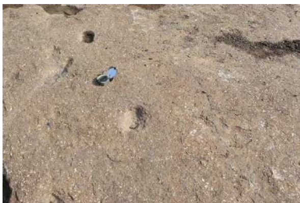
Fig. 1 - Amygdaloidal basalt exposed at foundation level