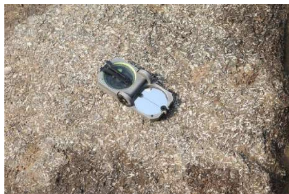
Fig. 2 - Porphyritic basalt exposed at foundation level