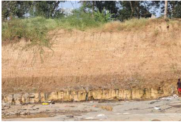
Fig. 3 - Weathering profile stratum-I, up to 7m depth completely weathered rock mass, Stratum-II moderately weathered to fresh basaltic rocks