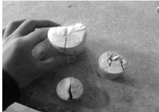
Fig. 9 – Fractured core samples