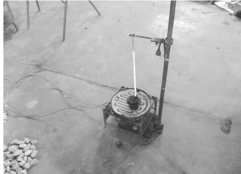
Fig. 6 - Flash and fire point test