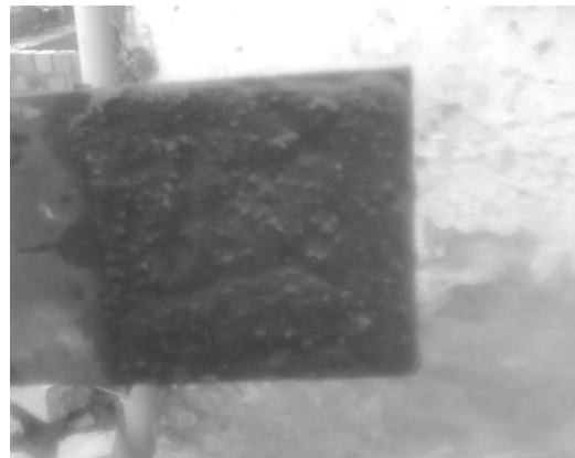
Fig. 7 – Cohesion test