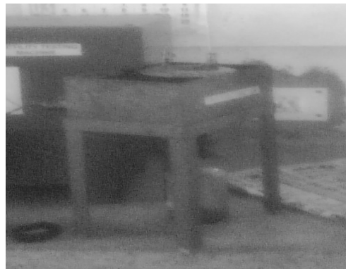
Fig. 8 - Viscometer