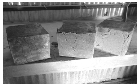
Fig. 5 – Samples after testing

The average strength of the grout was determined to be 15 N/mm 2 .