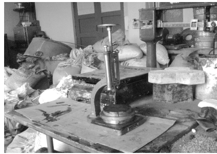
Fig. 3 – Vicats apparatus