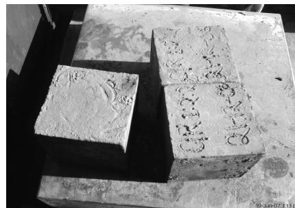
Fig. 4 – Samples before testing

The average strength of the grout was determined to be 15 N/mm 2 .