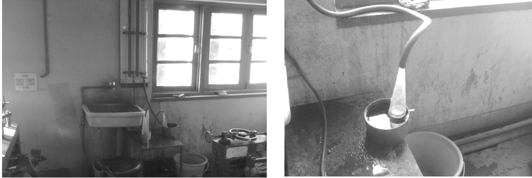
Fig. 10 - Permeability test of samples, performed in the laboratory