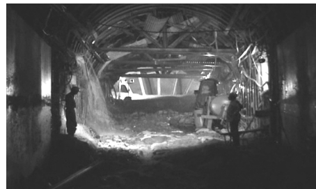
Fig. 2 – Tunnel in progress